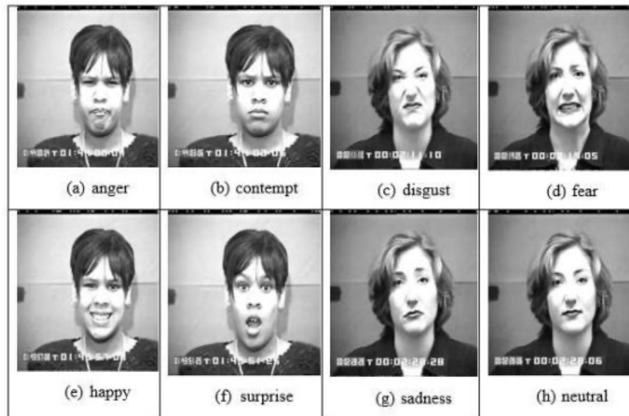
Figure 2. Range of feelings used in dataset