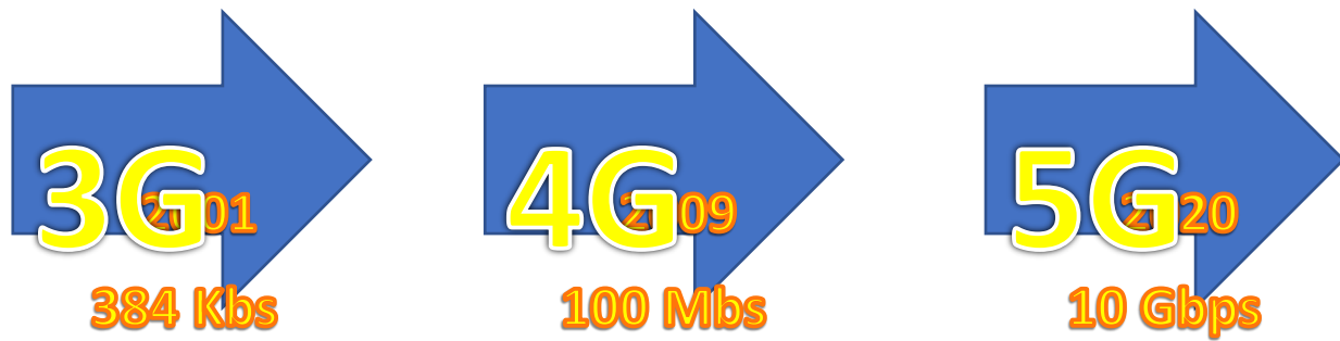
Figure 1. Representing technological evolution of mobile networks

industry with higher business aspects as to connect the world as 1000 times faster than existing technologies. Which might be provides evolution in health, transport, defense, entertainment areas [3.]